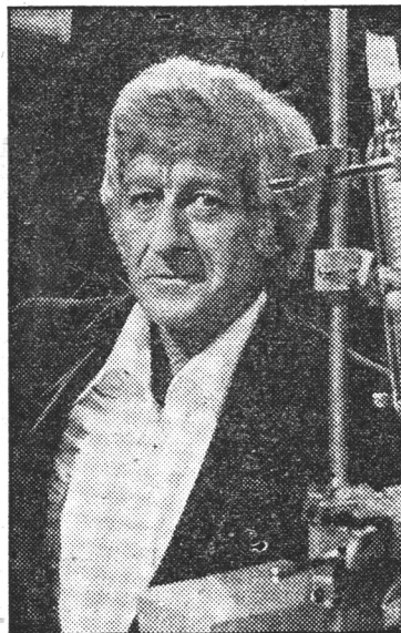
Jon Pertwee – 'he's invincible'