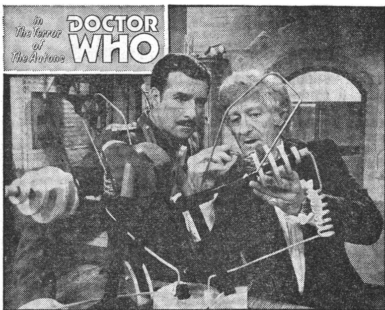
Old allies – Brigadier and Doctor – meet an old enemy: 5.15