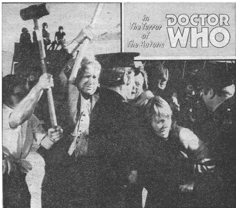
Jo Grant finds it's a tough life as the Doctor's assistant: 5.15